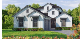
THE FARMHOUSE - TILE