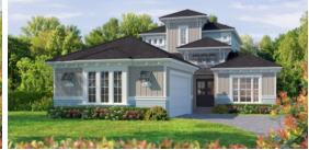
THE WEST INDIES - TILE