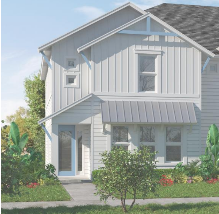
THE CASTILLO - C at NOCATEE