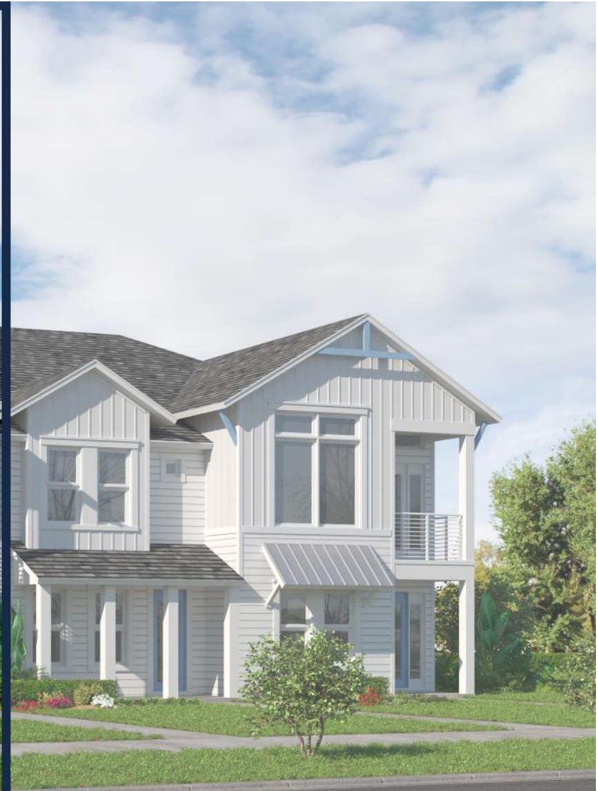
THE CASTILLO - FARMHOUSE