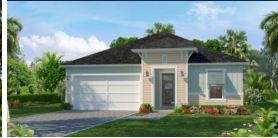
THE PALM CREST