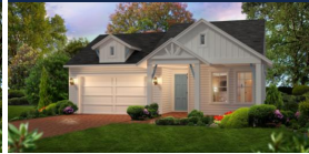
THE COASTAL MODERN