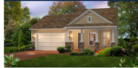
THE CRAFTSMAN MODERN