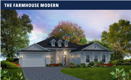
THE FARMHOUSE MODERN

Living Area: 2,624 ft 2 Under Roof: 3,542 ft 2