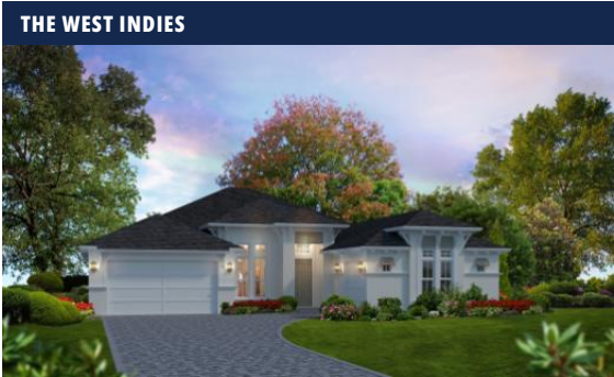
THE WEST INDIES

Living Area: 2,624 ft 2 Under Roof: 3,542 ft 2