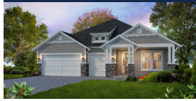
THE CRAFTSMAN MODERN