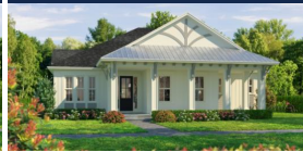
THE FRENCH QUARTER