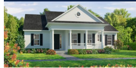
THE WEST INDIES