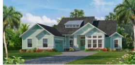
THE CRAFTSMAN II - CR