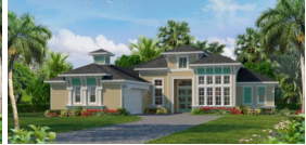
THE WEST INDIES - CR