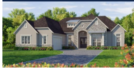
THE TRADITIONAL - TILE