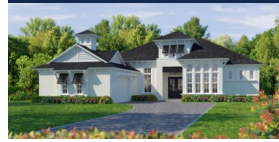
THE WEST INDIES - TILE