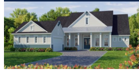
THE COASTAL - TILE