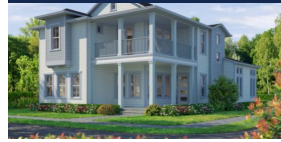
THE COASTAL CLASSIC - LP