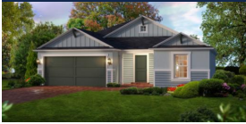
THE TRADITIONAL MODERN