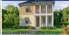
THE WEST INDIES